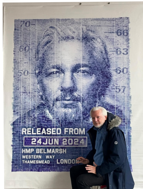
Andrei Molodkin & Julian Assange, Date of Freedom (2024)